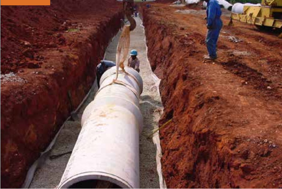
Construction of Welgedacht outfall sewer