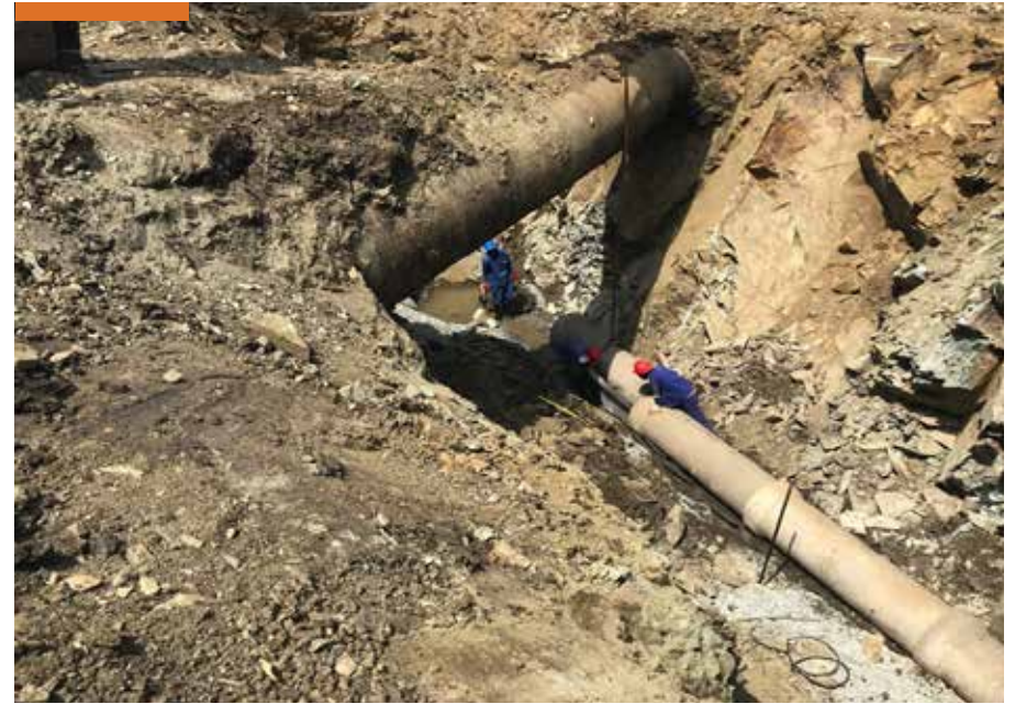
Construction of Illiondale outfall sewer